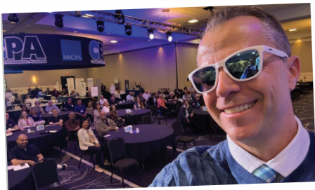
On the Road 2025