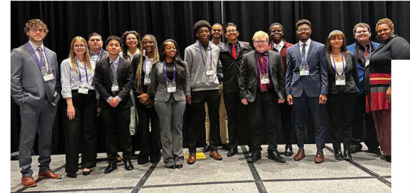
WMU at '24 NABA Regional Conference